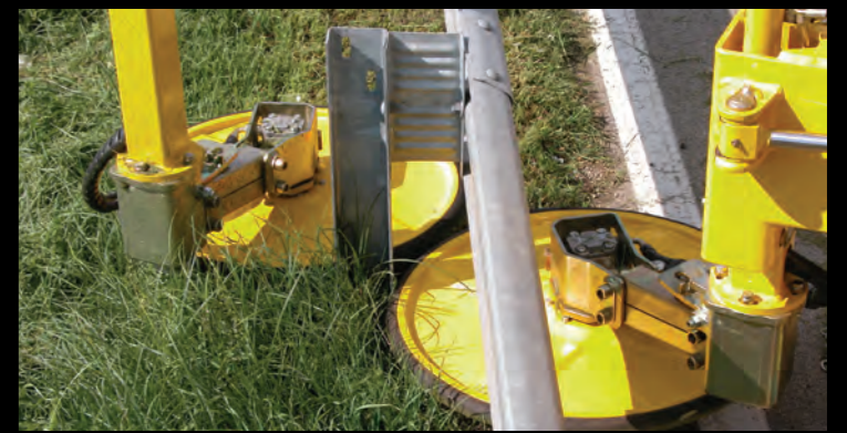
Innovative Twin Rotary Head Design