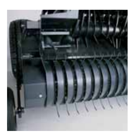
Optimum crop transfer The long pick-up tine guards and two short side augers ensure a smooth, uninterrupted crop flow to the feeder.

The 2.00m wide pick-up on the BR6090 can tackle the widest windrows and makes "weaving" almost unnecessary, so reducing operator fatigue. This results in equal filling of the bale for more uniform density and increased stability-even over longer storage periods.